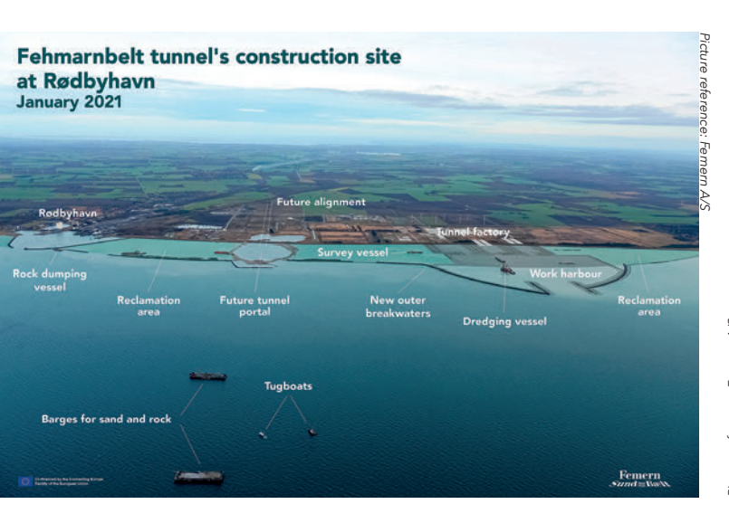
Fehmarnbelt tunnel's construction site ad Rødbyhavn (01/2021)

The owner-operated company SBM is one of the leading quality suppliers for concrete technology and mineral processing in the international market. The enterprise SBM develops, projects, and manufactures high-quality machines and plants for the raw material and recycling industries as well as innovative concrete mixing plants for ready-mixed and prefab concrete in Austria. Assembly and comprehensive support in after sales service are offered at home and abroad. SBM's core markets are road construction and civil engineering as well as ready-mixed and prefab concrete. This full-package supplier continuously proves its enormous