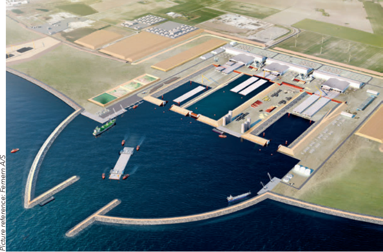
Illustration of the work harbour in Rødbyhavn